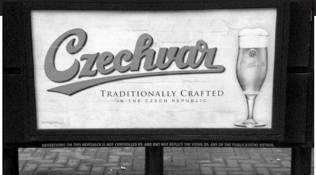
San Francisco news rack